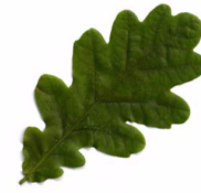
9. Oak (English)