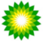
1. British Petroleum